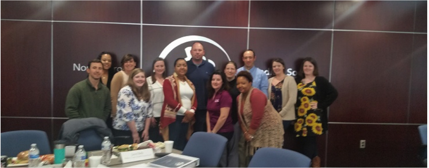
2017-2018 Emerging Leaders Program participants

We recently have added some new applications to our database that we're excited to share with you!