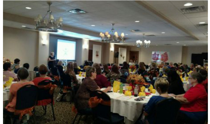
2016 FEC Nursing Session

The Nursing Section presents two awards and two scholarships each year. The following link will guide you to the information you need to nominate a deserving colleague for the Margaret B. Dolan Award or the Direct Service Award. The section also offers two scholarships