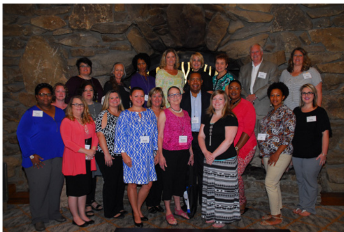
Social Work Section Members - FEC 2017

During NCPHA's Social Work Section monthly meetings, discussions surround public health social work, advocacy, and legislation in addition to ongoing efforts to recruit new members and planning for the Fall Educational Conference. This past March, we distributed nationally recognized "Social Work Month" information to our members in hopes they would share with their leadership and coworkers. Our monthly section meetings entail an opportunity for networking and fostering stimulating conversation and partnerships to support our section members as they conduct challenging work each day. The SW Section Membership Drive is going on June 1 - August 3; the more members you recruit to join the SW Section, the more chances you have to WIN $50!