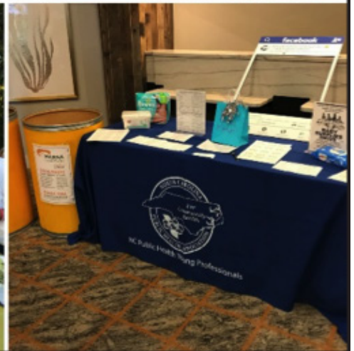
2016 & 2017 Fall Educational Conferences

The North Carolina Public Health Young Professionals (YP) are looking forward to the North Carolina Public Health Association's Fall Educational Conference. To celebrate 100 years of dental health and give back to our communities, we are hosting a Smile Drive! We have a goal to collect at least 1,000 pediatric oral health supplies. Donations include toothbrushes, toothpaste, floss/flossers, mouth rinse, mouth guards, toothbrush holders, brushing timers, and dental health educational products (i.e., books, puzzles, games).